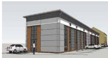
... to be replaced with the new Phase 4 development to be completed early 2011.