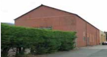
... the English Timber Mill, erected in 1952, under which the tank was located ...