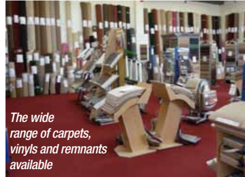
The wide range of carpets, vinyls and remnants available

Link Carpets, Unit 4, is celebrating a successful first year's trading at Link Business Centre