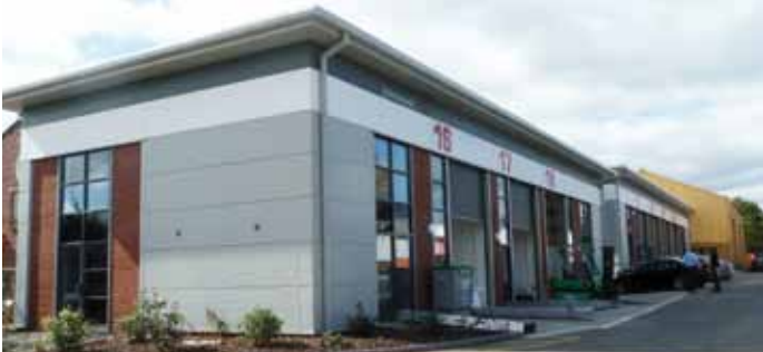
Link Business Centre has been providing modern business accommodation since 1980 in a secure environment with active management from the on site team.

Phase 4, the latest development at Link Business Centre has recently been completed. The new development, consisting of seven high specification, energy efficient industrial units with excellent insulation values, have quickly filled.