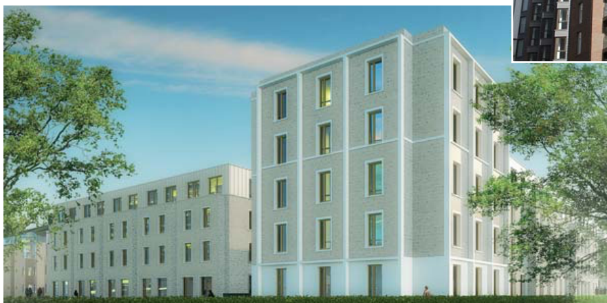
Pictured above: Bellway Homes, Canary Wharf, London. B R Hodgson supplied the external cladding for this select development of new homes in London Docklands.